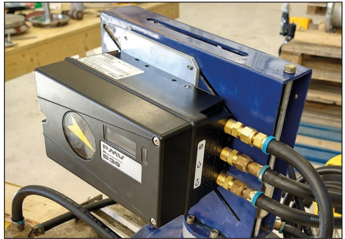
D30 POSITIONER RETROFITTED TO STI ACTUATOR